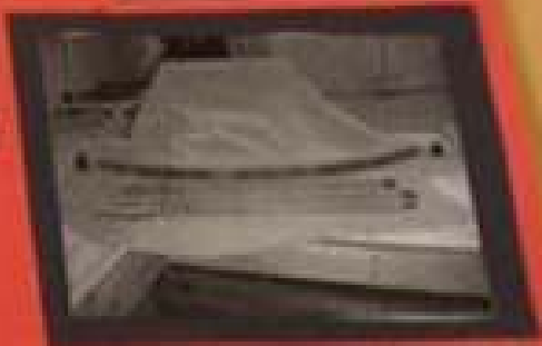
Traditional Salish arrow