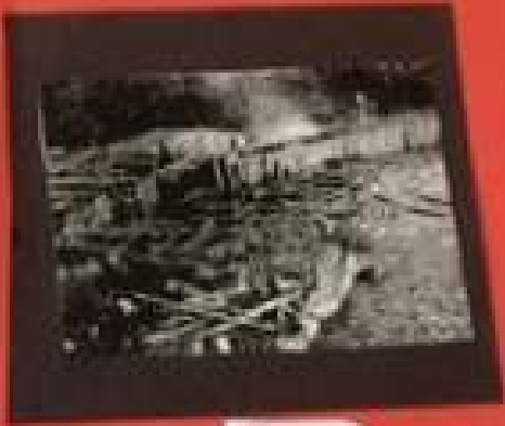
Village in ruins after war

Warfare Coast Salish warfare was a form of ritualized combat. It was not a war of extermination, but a war of prestige. The goal was to capture slaves, who were then sold to other tribes. Slaves were also used for labor and as a source of food. Warfare was also a way to settle disputes and gain territory. The Coast Salish used bows and arrows, spears, and clubs. They also used shields and armor. Warfare was often conducted in the winter months, when the weather was harsh and the food supply was low. This was a time when the tribes were looking for new sources of food and territory. Warfare was also a way to show off a tribe's strength and courage. It was a way to gain respect and status. Warfare was an important part of Coast Salish life. It was a way to survive and thrive in a harsh environment. Warfare was also a way to build a strong and united community. It was a way to defend their homes and their way of life. Warfare was a necessary part of Coast Salish life. It was a way to ensure their survival and prosperity.