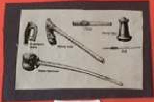
Tools used in village