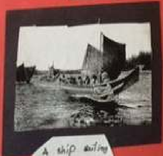
A ship sailing at daybreak to raid a village

Before Contact Before contact with other peoples, the Coast Salish lived in small, scattered groups. They were hunters and gatherers. They lived in simple houses made of brush and sticks. They wore simple clothing made of animal skins. They had simple tools and weapons. They lived in a harsh environment. They had to hunt and gather for their food. They had to defend their homes and their way of life. Warfare was an important part of their life. It was a way to survive and thrive in a harsh environment. Warfare was also a way to build a strong and united community. It was a way to defend their homes and their way of life. Warfare was a necessary part of Coast Salish life. It was a way to ensure their survival and prosperity.